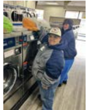
Our CIT consumers learned how to sort and wash laundry at a Laundry Mat