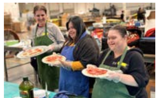
Our Corona CIT and Activity Center consumers participating in a cooking lesson