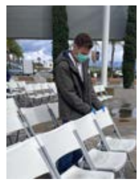
Our Corona CIT consumers cleaning and setting up chairs for an event at Harvest church